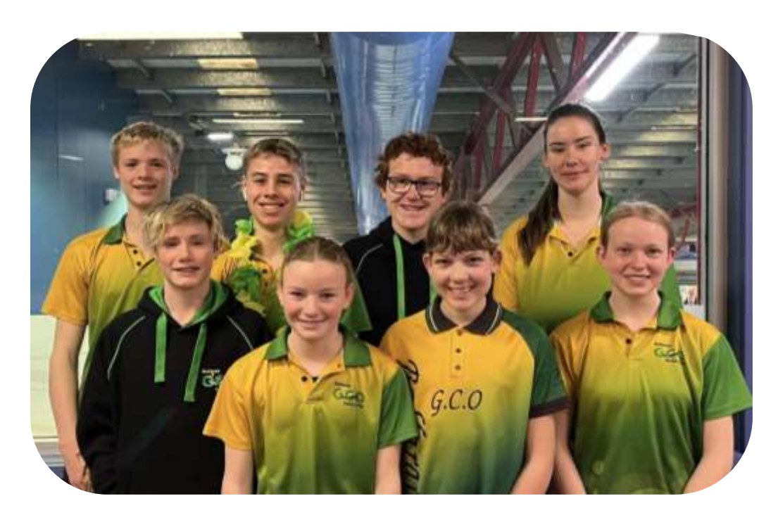
GCO at the Victorian Short Course Country Championships 2023